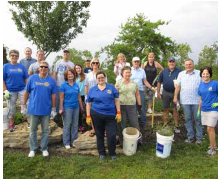
(Above) Mount Vernon's Rotary Club spent a hot summer evening at the park, picking up trash, weeding, and cleaning mulch beds. Thank you for your hard work!

In 2018, we welcome local service organizations to "Adopt a Weekend" at the Clock House during the months of April through September, so we can keep it open for local and out of town visitors. Also, help with our free community concert series and movie series is always appreciated.